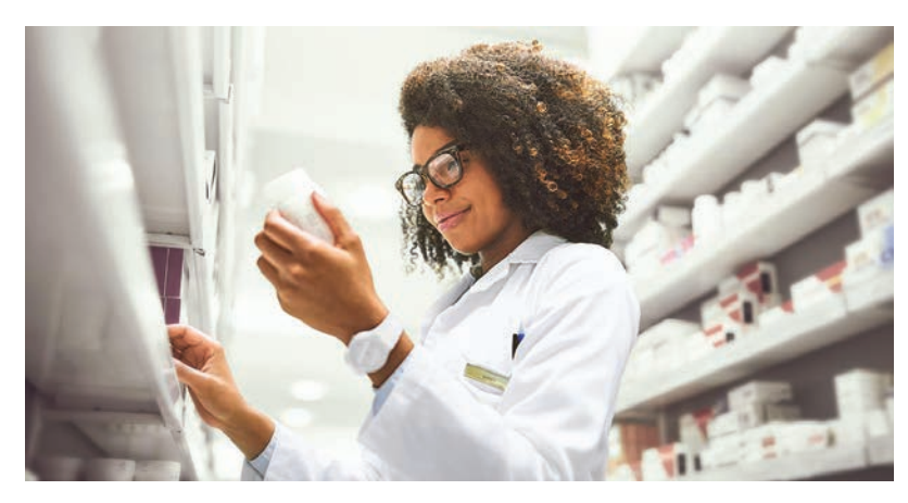
1200x627 image (lifestyle/stock image) JPG